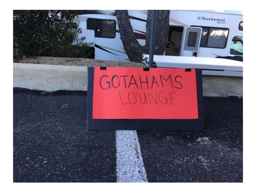
The new lounge is installed