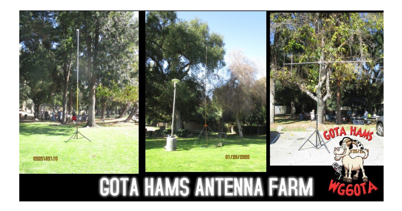
Antennas? Oh yeah we got that covered also